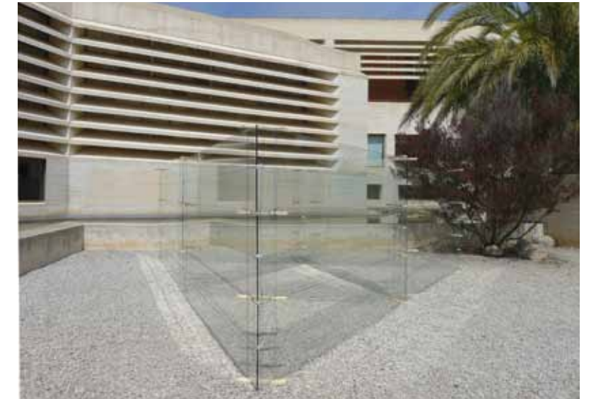
triangle in sculpture garden