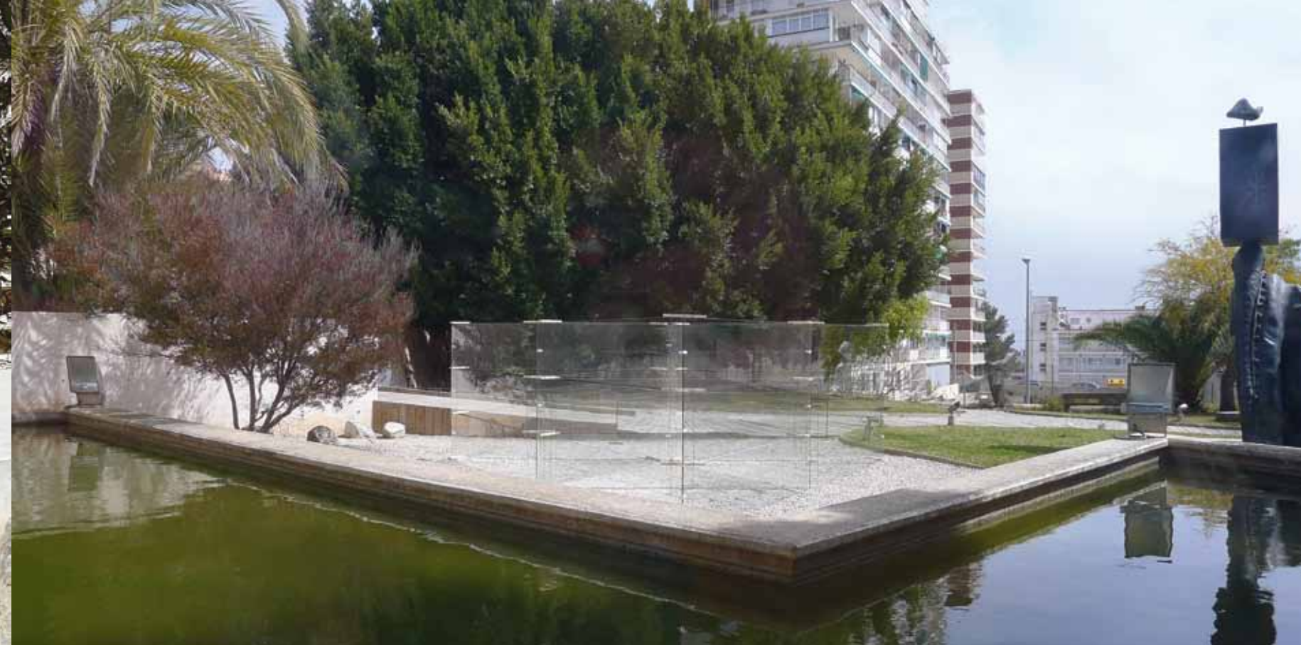
the initial inspiration for the serdica triangles were the triangular fortifications that are part of the roman remains in sofia. in this case the triangles are adapted to the idiom of the architect of the miró museum, rafael moneo.