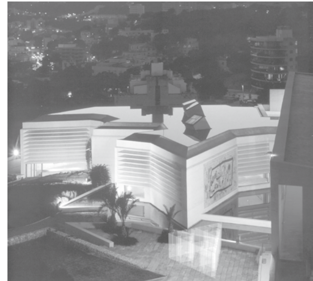
preliminary design triangle in moneo buiding area